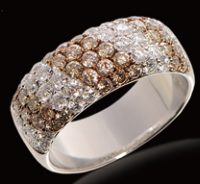
3 K18WG Diamond Ring D=0.64ct BD=0.86ct ¥588,000