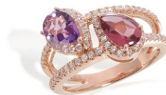
12 K18PG Amethyst, Tourmaline Ring A=0.59ct PT=0.59ct D=0.42ct ¥324,000