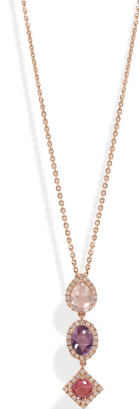
11 K18PG Rose Quartz, Amethyst, Tourmaline Pendant RQ=0.70ct A=0.82ct PT=0.38ct D=0.32ct ¥297,000