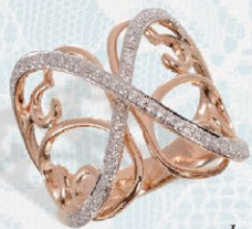
1 K18PG/WG Diamond Ring D=0.23ct ¥270,000