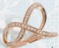
3 K18PG Diamond Ring D=0.26ct ¥264,600