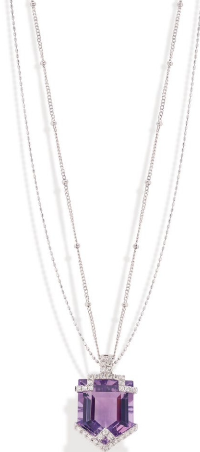
13 K18WG Amethyst Pendant A=8.00ct D=0.25ct ¥324,000