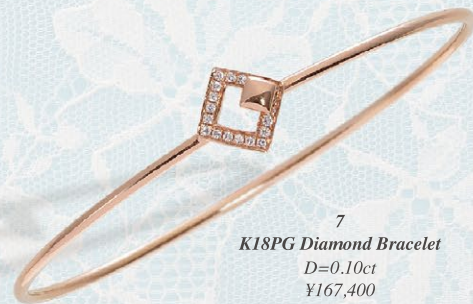
7 K18PG Diamond Bracelet D=0.10ct ¥167,400

★表示価格には、消費税が含まれております。価格は予告なく変更する場合がございます。 商品写真は若干拡大で表現しております。