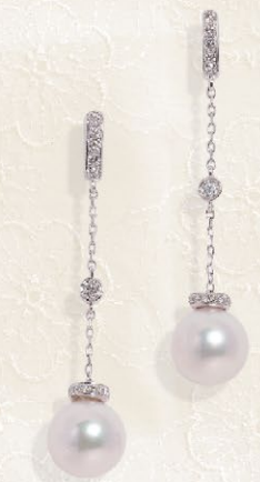
19 K18WG Akoya Pearl Pierced Earrings P=7.5 - 8.0mm D=0.20ct ¥264,600