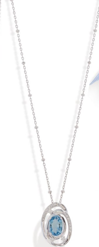
16 K18WG Aquamarine Pendant A=0.68ct D=0.073ct ¥297,000