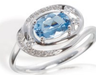
17 K18WG Aquamarine Ring A=0.70ct D=0.078ct ¥253,800