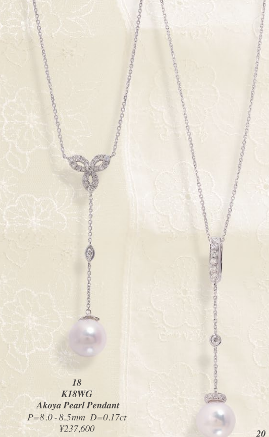
18 K18WG Akoya Pearl Pendant P=8.0 - 8.5mm D=0.17ct ¥237,600