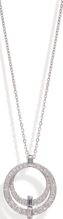
8 K18WG Diamond Pendant D=1.15ct ¥837,000