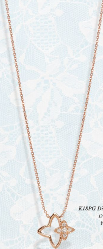
5 K18PG Diamond Pendant D=0.05ct ¥86,400