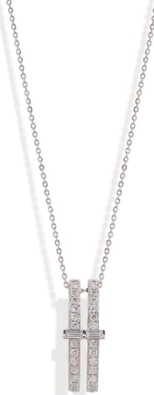
9 K18WG Diamond Pendant D=0.80ct ¥594,000