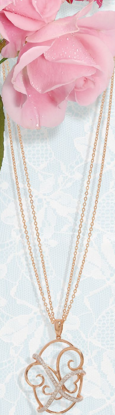
2 K18PG/WG Diamond Pendant D=0.19ct ¥286,200