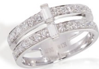
10 K18WG Diamond Ring D=0.77ct ¥561,600