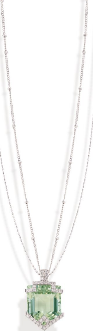
15 K18WG Green Amethyst Pendant GA=8.00ct D=0.25ct ¥324,000