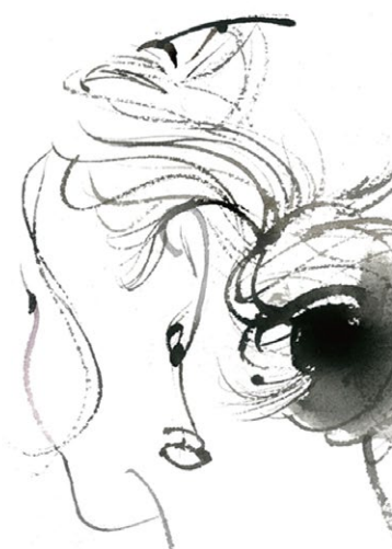
K18PG Rose Quartz & Amethyst Pierced Earrings RQ=2.54ct A=2.62ct ¥275,000 + tax The ball will rotate.