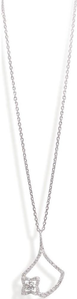
14 K18WG Diamond Pendant D=0.44ct ¥275,000 + tax