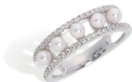
23 K18WG Akoya Pearl Ring 3.0-3.5mm D=0.23ct ¥240,000 + tax