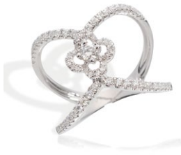
15 K18WG Diamond Ring D=0.46ct ¥300,000 + tax