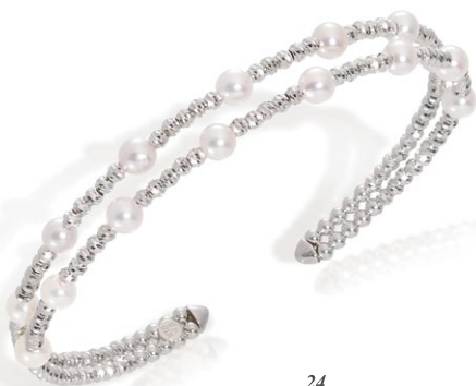
24 K18WG Akoya Pearl Bangle 3.5-4.0mm ¥175,000 + tax