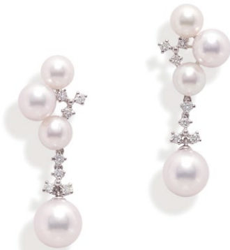
17 K18WG Akoya Pearl Pierced Earrings 5.0 - 7.0mm D=0.21ct ¥225,000 + tax