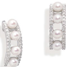
22 K18WG Akoya Pearl Pierced Earrings 3.0-3.5mm D=0.30ct ¥275,000 + tax