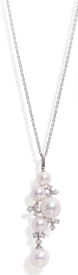
19 K18WG Akoya Pearl Pendant 5.0 - 7.0mm D=0.15ct ¥200,000 + tax