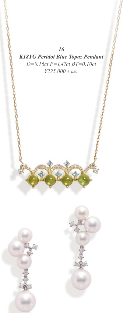
16 K18YG Peridot Blue Topaz Pendant D=0.16ct P=1.47ct BT=0.10ct ¥225,000 + tax