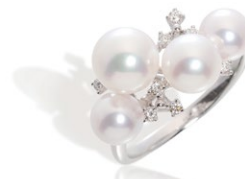
20 K18WG Akoya Pearl Ring 5.5 - 6.5mm D=0.09ct ¥150,000 + tax