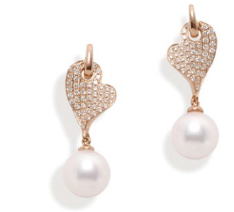
18 K18PG Akoya Pearl Pierced Earrings 7.0 - 7.5mm D=0.25ct ¥170,000 + tax