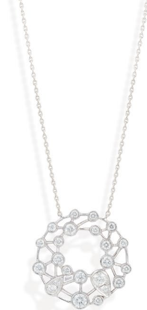
20 K18WG Diamond Pendant D=0.61ct ¥ 440,000