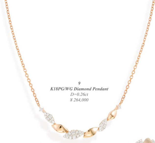
9 K18PG/WG Diamond Pendant D=0.26ct ¥ 264,000