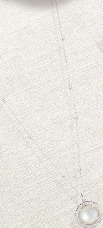
4 K18WG Green Quarts Pendant GQ=1.46ct D=0.11ct ¥ 187,000