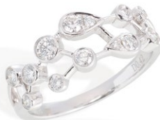
19 K18WG Diamond Ring D=0.42ct ¥ 297,000