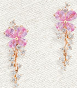
3 K18PG Pink Sapphire Pierced Earrings PS=1.00ct×2 D=0.33ct×2 ¥ 396,000

★価格は消費税込。 ★価格は予告なく変更する場合がございます。 ★商品写真は若干拡大して表現しております。