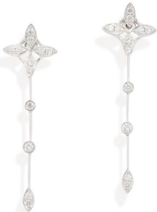
18 K18WG Diamond Pierced Earrings D=0.18ct×2 ¥ 297,000