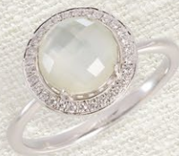
6 K18WG Green Quarts Ring GQ=1.51ct D=0.11ct ¥ 187,000