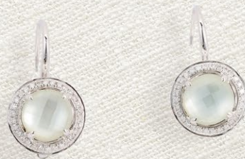
5 K18WG Green Quarts Pierced Earrings GQ=1.11ct×2 D=0.08ct×2 ¥ 231,000

★価格は消費税込。 ★価格は予告なく変更する場合がございます。 ★商品写真は若干拡大して表現しております。