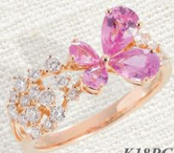
2 K18PG Pink Sapphire Ring PS=1.31ct D=0.44ct ¥ 352,000