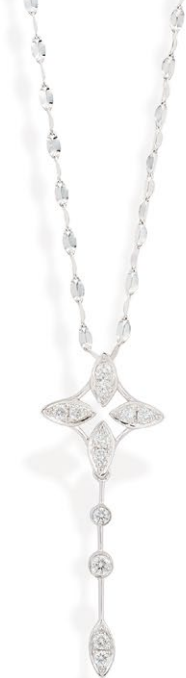
17 K18WG Diamond Pendant D=0.28ct ¥ 242,000