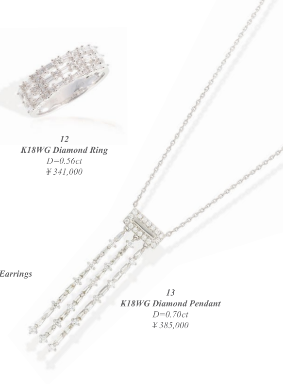
13 K18WG Diamond Pendant D=0.70ct ¥ 385,000