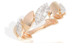
10 K18PG/WG Diamond Ring D=0.23ct ¥ 187,000