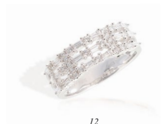
12 K18WG Diamond Ring D=0.56ct ¥ 341,000