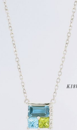
14 K18WG Blue Topaz Peridot Pendant CS=1.28ct D=0.03ct ¥176,000