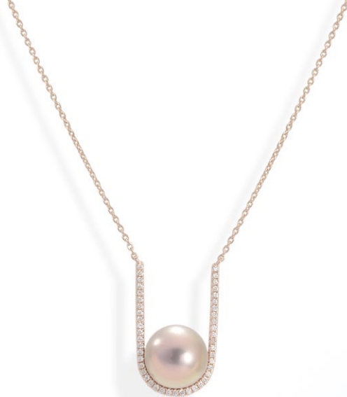
23 K18PG Purple Fresh Water Pearl Pendant P=10.5mm D=0.16ct ¥275,000

★価格は予告なく変更する場合がございます。 商品写真は若干拡大で表現しております。