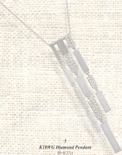
5 K18WG Diamond Pendant D=0.27ct ¥440,000