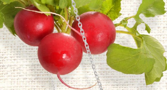
1 K18WG Diamond Necklace D=0.22ct ¥242,000