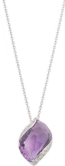
8 K18WG Amethyst Pendant AM=5.86ct D=0.09ct ¥264,000