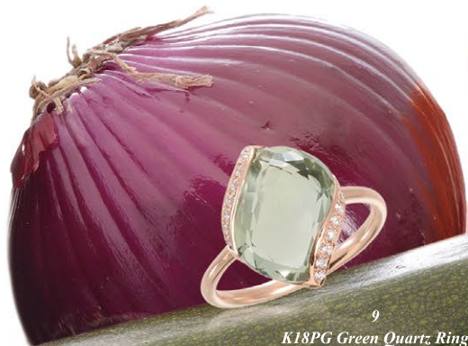
9 K18PG Green Quartz Ring GQ=5.22ct D=0.10ct ¥330,000