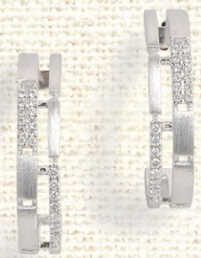
7 K18WG Diamond Pierced Earrings D=0.11ct × 2 ¥451,000