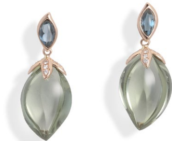
12 K18PG Green Quartz Pierced Earrings GQ=9.61ct × 2 LBT=0.42ct × 2 D=0.04ct × 2 ¥253,000