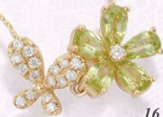
16 K18YG Peridot Pendant PE=1.10CT D=0.12ct ¥ 253,000