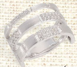
6 K18WG Diamond Ring D=0.29ct ¥473,000