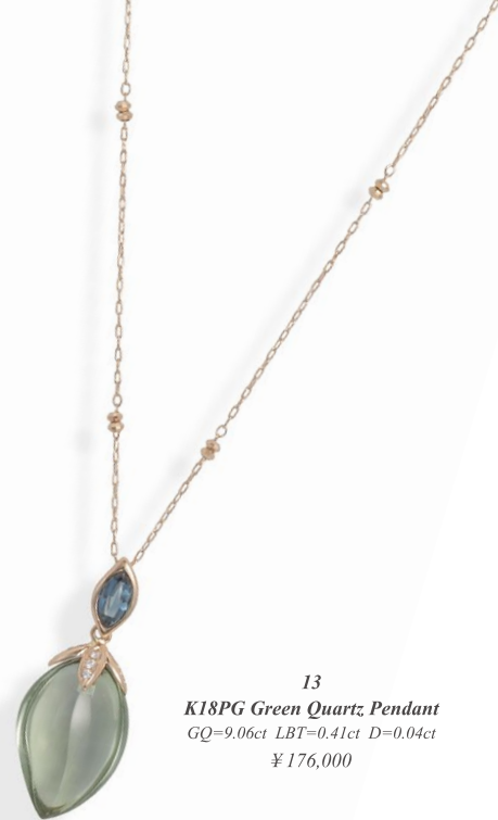
13 K18PG Green Quartz Pendant GQ=9.06ct LBT=0.41ct D=0.04ct ¥176,000