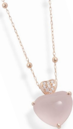
17 K18PG Rose Quartz Pendant RQ=6.26ct D=0.04ct ¥ 242,000