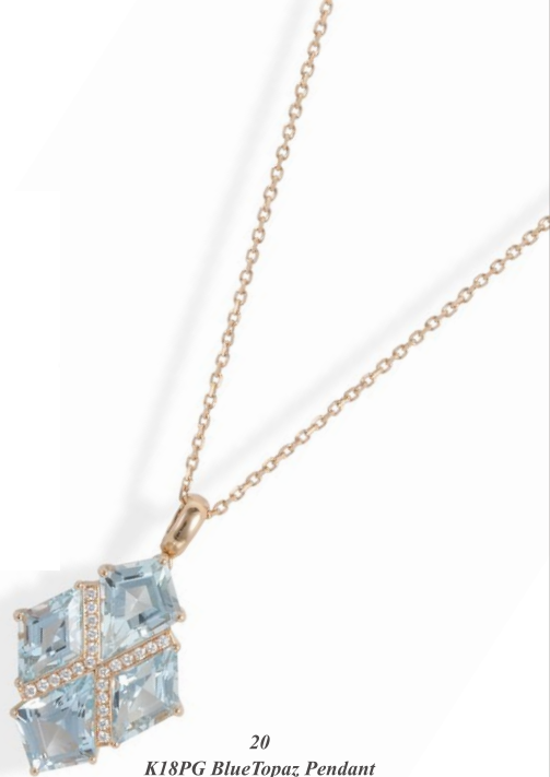
20 K18PG Blue Topaz Pendant BT=7.32ct D=0.11ct ¥ 429,000