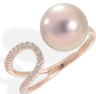
21 K18PG Purple Fresh Water Pearl Ring P=10.5mm D=0.13ct ¥264,000