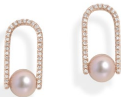
22 K18PG Purple Fresh Water Pearl Pierced Earrings P=6.0mm D=0.09ct × 2 ¥198,000