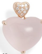
18 K18PG Rose Quartz Pierced Earring RQ=7.54ct × 2 D=0.035ct × 2 ¥ 374,000