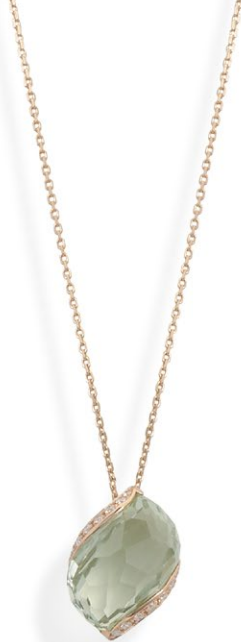
11 K18PG Green Quartz Pendant GQ=4.90ct D=0.09ct ¥264,000