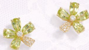
15 K18YG Peridot Pierced Earrings PE=0.90ct × 2 D=0.03ct × 2 ¥ 198,000