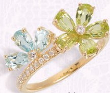
14 K18YG Peridot Blue Topaz Ring PE=1.12ct BT=0.66ct D=0.09ct ¥ 198,000