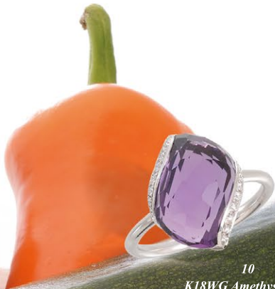
10 K18WG Amethyst Ring AM=5.86ct D=0.10ct ¥330,000