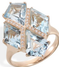
19 K18PG Blue Topaz Ring BT=7.70ct D=0.09ct ¥ 473,000