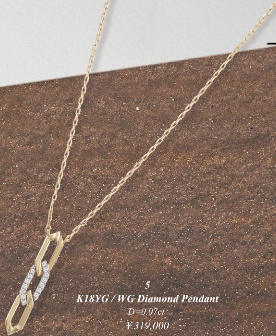
5 K18YG / WG Diamond Pendant D=0.07ct ¥ 319,000