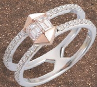
1 K18PG / WG Diamond Ring D=0.61ct ¥ 847,000