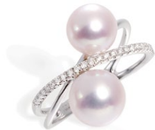
21 K18WG Akoya Pearl Ring P=7.0 ~ 8.0mm D=0.11ct ¥264,000