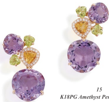
15 K18PG Amethyst Peridot Citrine Pierced Earrings AM=6.74ct × 2 PE=0.51ct × 2 CI=0.32ct × 2 D=0.05ct × 2 ¥ 682,000