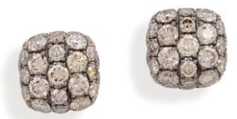
12 K18PG Brown Diamond Pierced Earrings D=1.07ct × 2 ¥ 528,000