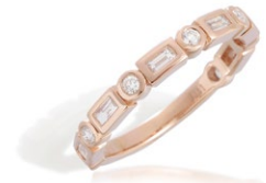
7 K18PG Diamond Ring D=0.41ct ¥ 385,000