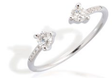
8 K18WG Diamond Ring D=0.27ct ¥ 253,000