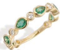
17 K18YG Emerald Ring E=0.64ct D=0.20ct ¥ 352,000