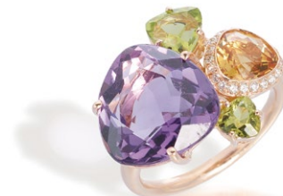
16 K18PG Amethyst Peridot Citrine Ring AM=7.22ct PE=1.24ct CI=1.03ct D=0.11ct ¥ 528,000