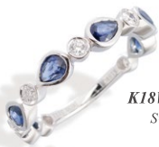
19 K18WG Sapphire Ring S=1.11ct D=0.20ct ¥ 330,000