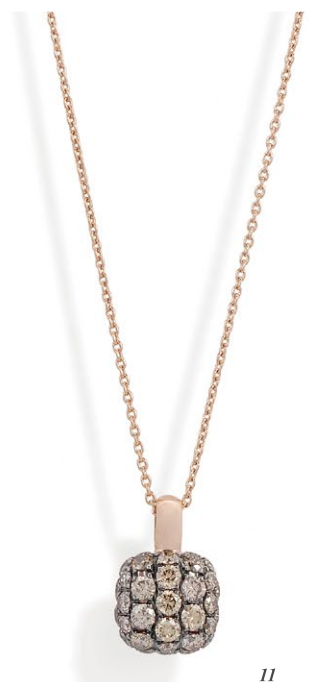
11 K18PG Brown Diamond Pendant D=1.38ct ¥ 429,000