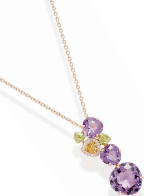
14 K18PG Amethyst Peridot Citrine Pendant AM=7.36ct PE=0.56ct CI=0.28ct D=0.06ct ¥ 528,000