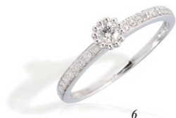
6 K18WG Diamond Ring D=0.32ct ¥ 286,000