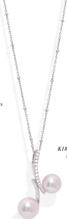
22 K18WG Akoya Pearl Pendant P=7.0 ~ 8.0mm D=0.08ct ¥286,000

★価格は予告なく変更する場合がございます。 商品写真は若干拡大で表現しております。