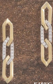
3 K18YG / WG Diamond Pierced Earrings D=0.07ct × 2 ¥ 319,000