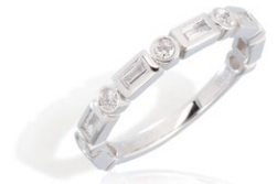
9 K18WG Diamond Ring D=0.36ct ¥ 385,000