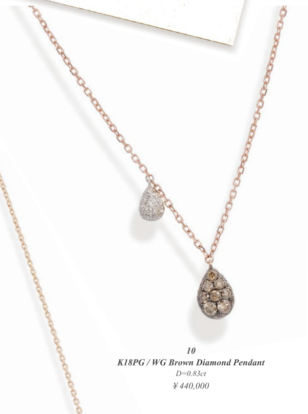
10 K18PG / WG Brown Diamond Pendant D=0.83ct ¥ 440,000