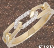
4 K18YG / WG Diamond Ring D=0.07ct ¥ 264,000