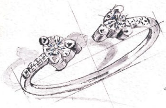
K18WG Diamond Ring