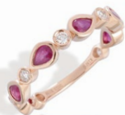
18 K18PG Ruby Ring R=1.09ct D=0.20ct ¥ 341,000