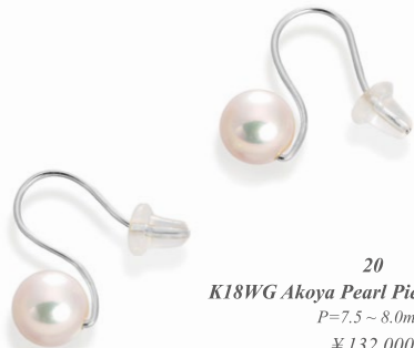
20 K18WG Akoya Pearl Pierced Earrings P=7.5 ~ 8.0mm ¥132,000