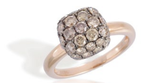
13 K18PG Brown Diamond Ring D=1.60ct ¥ 396,000