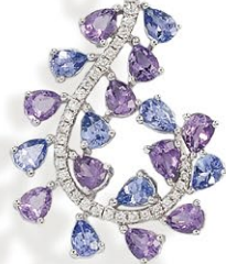
19 K18WG Tanza Amethyst Pendant TZ=1.08ct AM=1.35ct D=0.17ct ¥ 451,000