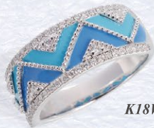
14 K18WG Blue / Brightblue Enamel Ring D=0.30ct ¥ 528,000