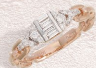
1 K18PG Diamond Ring D=0.19ct ¥242,000