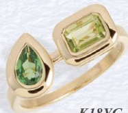
16 K18YG Peridot Diopside Ring PD=0.58ct D=0.36ct ¥ 209,000