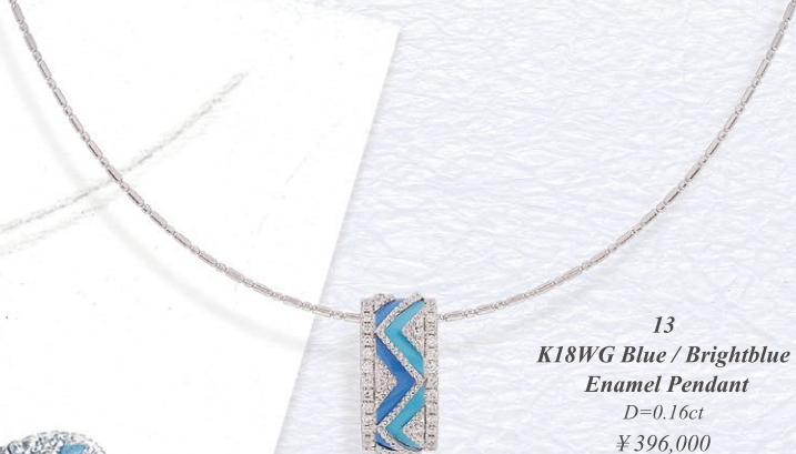
13 K18WG Blue / Brightblue Enamel Pendant D=0.16ct ¥ 396,000