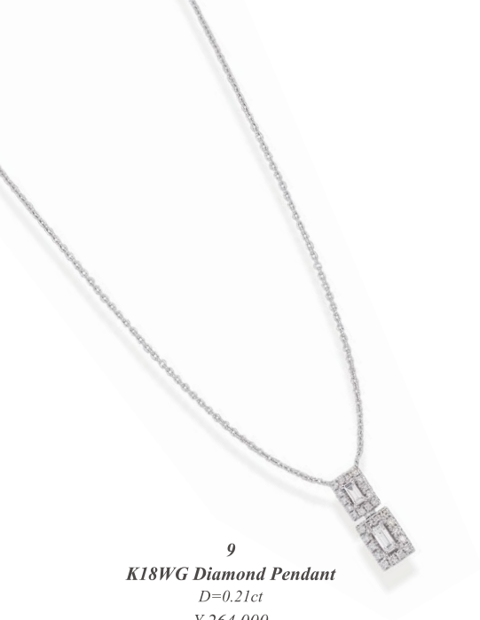
9 K18WG Diamond Pendant D=0.21ct ¥264,000