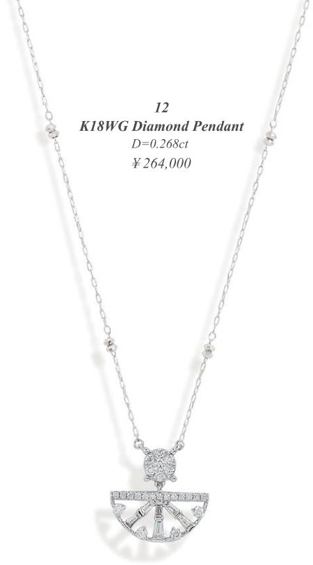
12 K18WG Diamond Pendant D=0.268ct ¥264,000