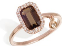
22 K18PG Smoky Quartz Ring SQ=1.12ct D=0.12ct ¥ 198,000