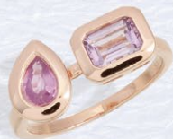
17 K18PG Pink Sapphire Amethyst Ring PS=0.44ct AM=0.47ct ¥ 242,000