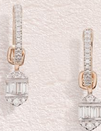
2 K18PG Diamond Pierced Earrings D=0.20ct X 2 ¥363,000