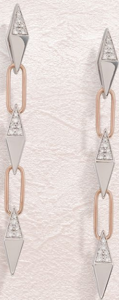
5 K18PG / WG Diamond Pierced Earrings D=0.16ct X 2 ¥693,000