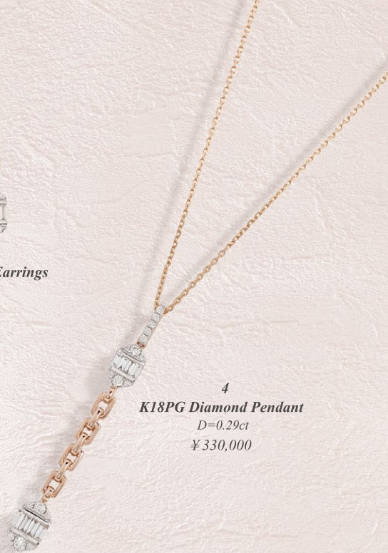
4 K18PG Diamond Pendant D=0.29ct ¥330,000