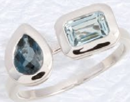
15 K18WG Blue Topaz Ring BT=1.14ct ¥ 209,000