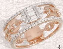
3 K18PG Diamond Ring D=0.389ct ¥451,000