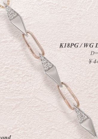
6 K18PG / WG Diamond Pendant D=0.14ct ¥440,000