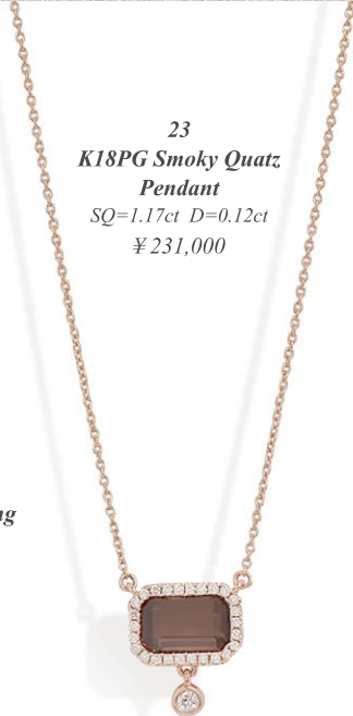
23 K18PG Smoky Quartz Pendant SQ=1.17ct D=0.12ct ¥ 231,000