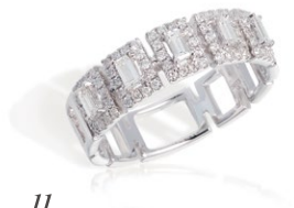
11 K18WG Diamond Ring D=0.46ct ¥418,000