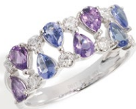
18 K18WG Tanza Amethyst Ring TZ=0.48ct AM=0.53ct D=0.17ct ¥ 264,000