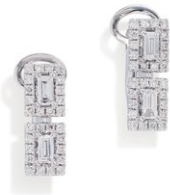
10 K18WG Diamond Pierced Earrings D=0.18 ct × 2 ¥363,000