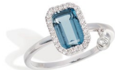
21 K18WG London Blue Topaz Ring BT=1.37ct D=0.12ct ¥ 198,000